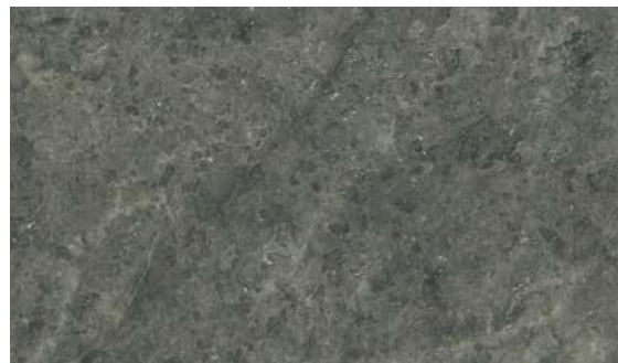
gris du gent M68S