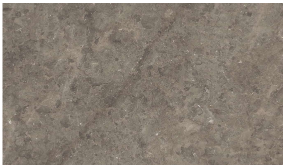
gris du gent M6YJ